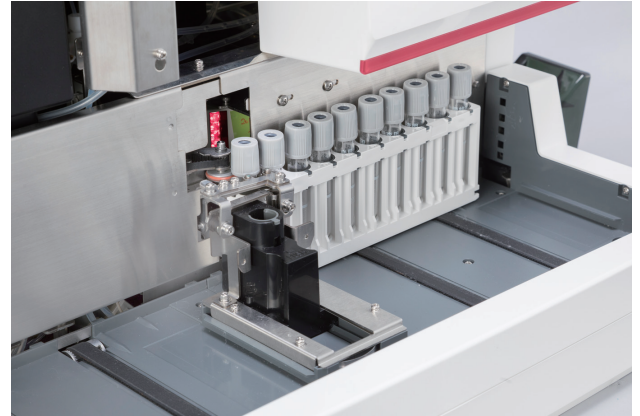
Identified as a set

Pair rack can have a barcode labeled-sample tube and a sample cup identified as a pair, contributing to safety aspects by preventing mix-up and streamlined work flow.